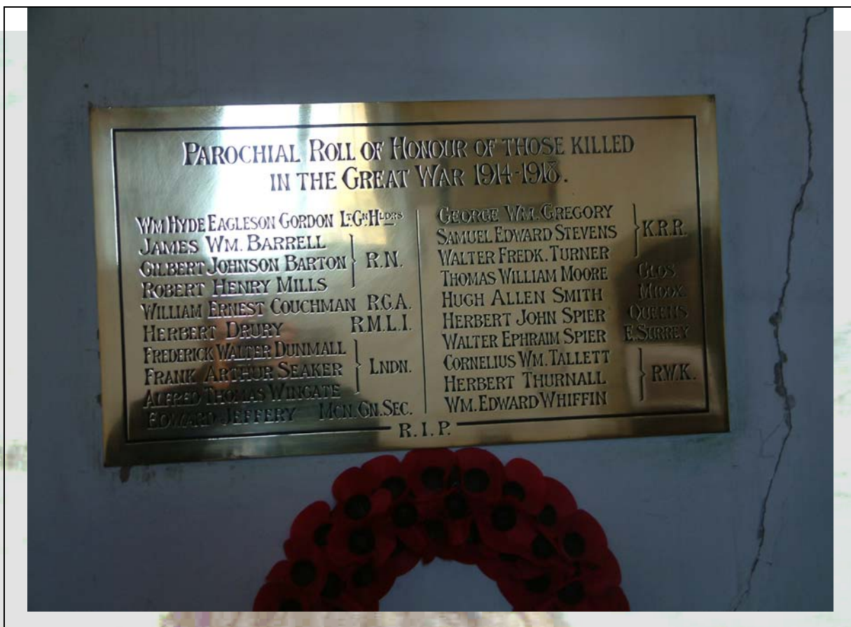
This brass memorial is found on the wall facing you as you enter the church. The following men are listed on this plaque.